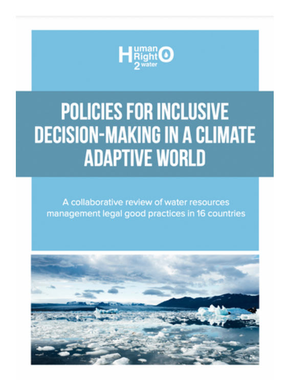
Figure 2 Policies for Inclusive Decision-Making in a Climate Adaptive World Publication

Our events highlighted the urgency of being decisions inclusive for about climate adaptation policies, emphasizing the holistic required for sustainable view resource management, and the impact on vulnerable communities. For a brief review of the methodology, you may review our Policy Brief comparing the framework principles of the human right to a clean, healthy and sustainable environment, with the principles of the human rights to water and sanitation.