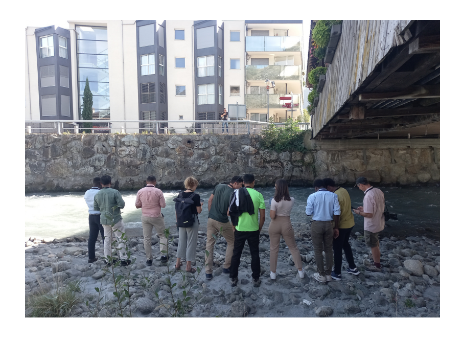
Figure 3 AGUASAN In-person Workshop in Martigny, River Excursion.

Participants in the workshop joined from 15 different countries, and exchanged knowledge and best practices on the general topic of digitalisation and data management in the water sector. The Aguasan Workshop is a long-standing Swiss institution that charts progress towards actionable strategies and partnerships by fostering collaboration and understanding.