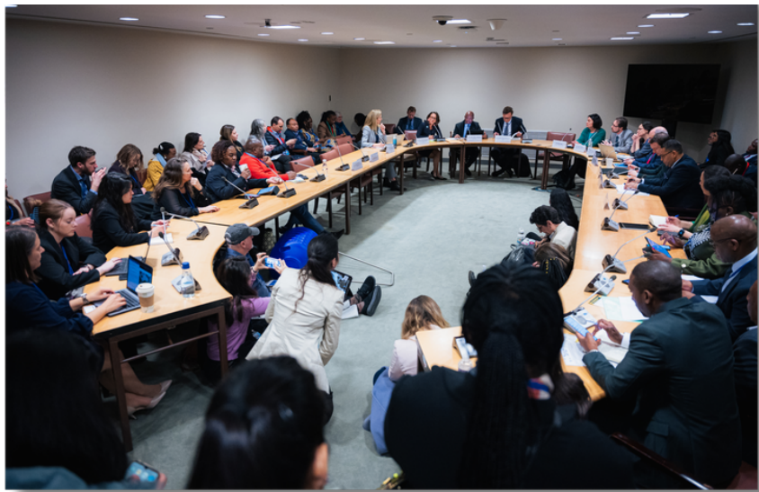
Figure 2 Integrated Water and Climate Solutions Side Event at the UN Water Conference