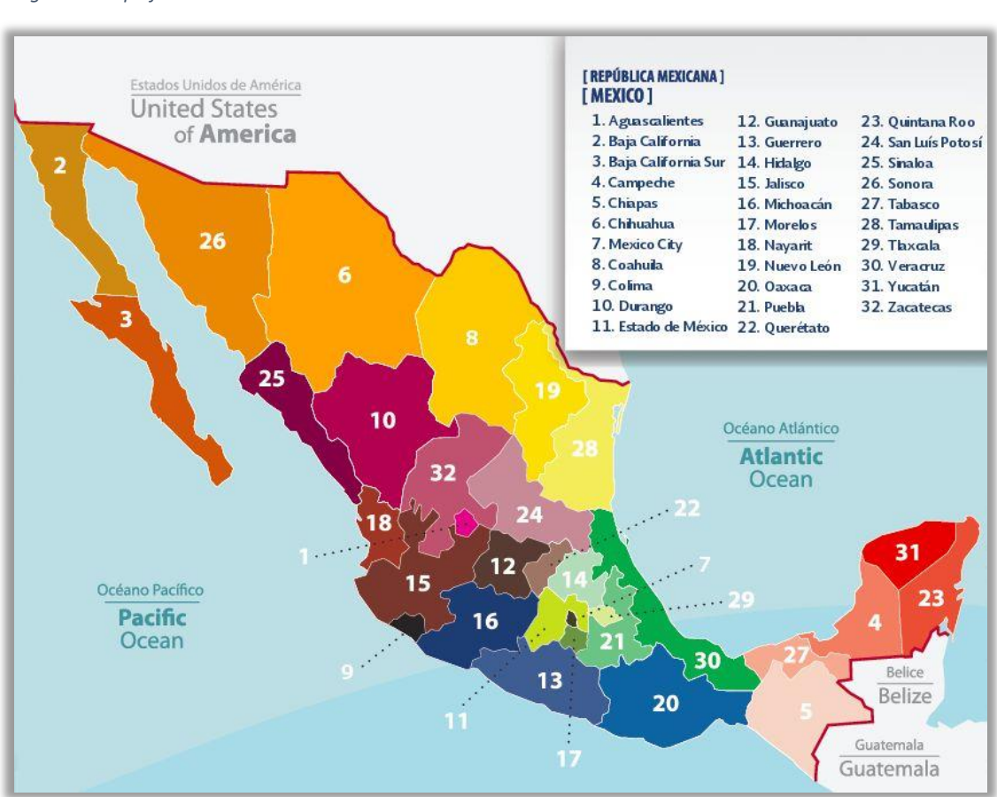
Figure 1. Map of Mexican States

Mexico is a Federation composed of 31 States and another federal entity, Mexico City, previously known as the Federal District ( Distrito Federal ). In terms of governing law, the Political Constitution of the United States of Mexico (hereinafter "Political Constitution of Mexico", "Constitution of Mexico", "Constitution") is supreme.<sup>4</sup> The Federal Executive power is vested in the President. The Executive maintains the power of authority and administration of national water. It may issue standards and